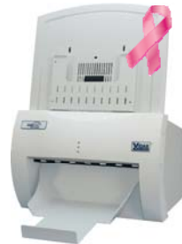
CAD PRO® Advantage