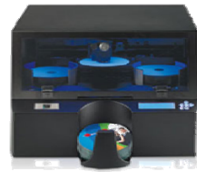
Patient CD Input/Output