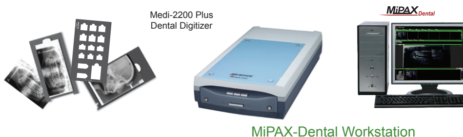
Medi-2200 Plus Dental Digitizer